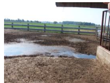
Don't let this come out of your silo.

Leachate can be diverted to well-ventilated manure storage facilities or treated through the use of filter areas, absorption systems, constructed wetlands or vegetated leachate treatment areas. CAUTION: Never mix silage effluent in enclosed tanks, especially tanks with barns because silage effluent mixed with manure slurry will accelerate the release of hydrogen sulphide gas. Add seepage only to uncovered outdoor storages.